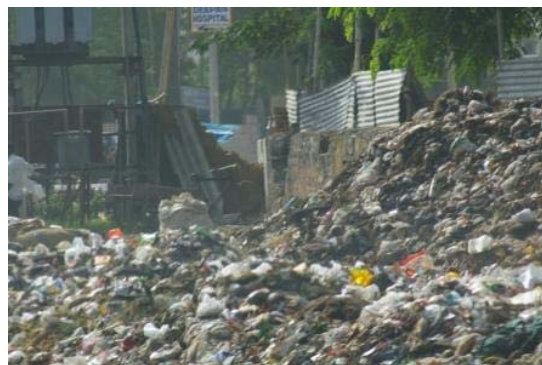
Roadside garbage in Delhi