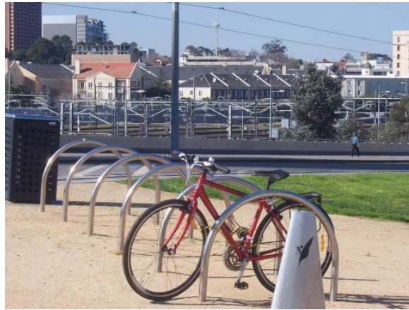
The city of Melbourne provides garbage bins (green bin to the left) and bicycle stands.

Free societies do not have inefficient, tenured civil services. It is fortunate for Melbourne City that it does not have IAS officers.