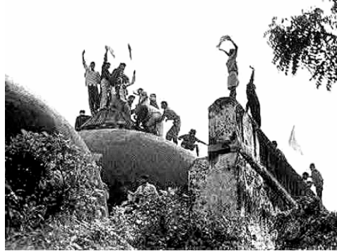
Demolition of Babri Masjid

So long as the people do not care to exercise their freedom, those who wish to tyrannize will do so; for tyrants are active and ardent, and will devote themselves in the name of any number of gods, religious and otherwise, to put shackles upon sleeping men. – Voltaire