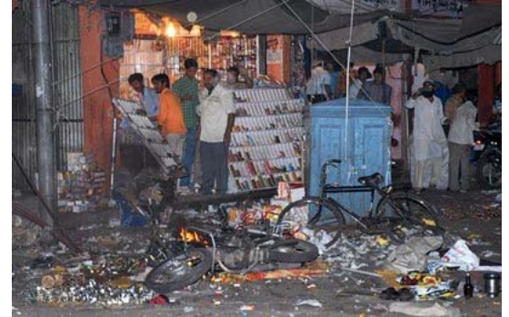
Bomb blast in Jaipur last month

The citizenship of free India comes with its responsibilities. In a free society, it is a minimum requirement that everyone must respect the life and liberty of others. Freedom is not license to destroy or kill. Intolerance, hate-mongering, and lawlessness of any sort is totally unacceptable.